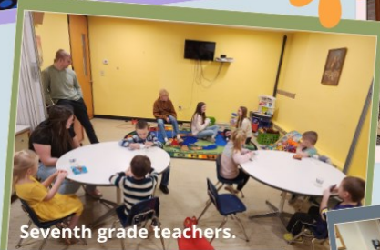
Seventh grade teachers.