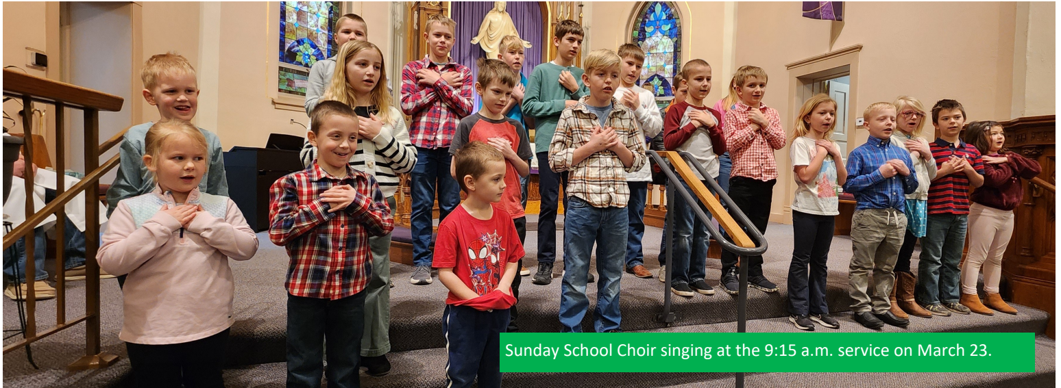
Sunday School Choir singing at the 9:15 a.m. service on March 23.

APRIL 2025 | CHRIST CENTERED | BIBLE BASED | FAMILY FOCUSED | MISSION MINDED