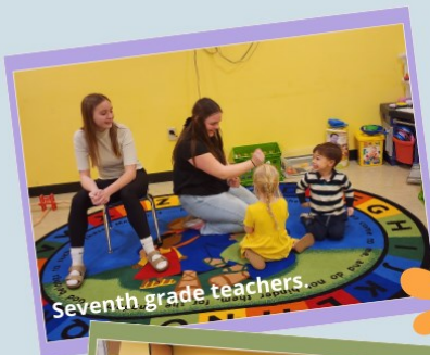
Seventh grade teachers.