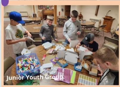
Junior Youth Group.

March was filled with memory work, music and mixing up the teachers.