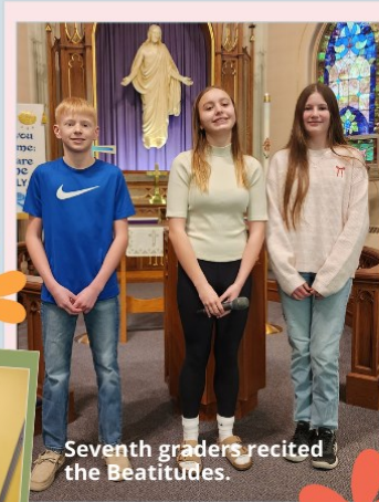
Seventh graders recited the Beatitudes.