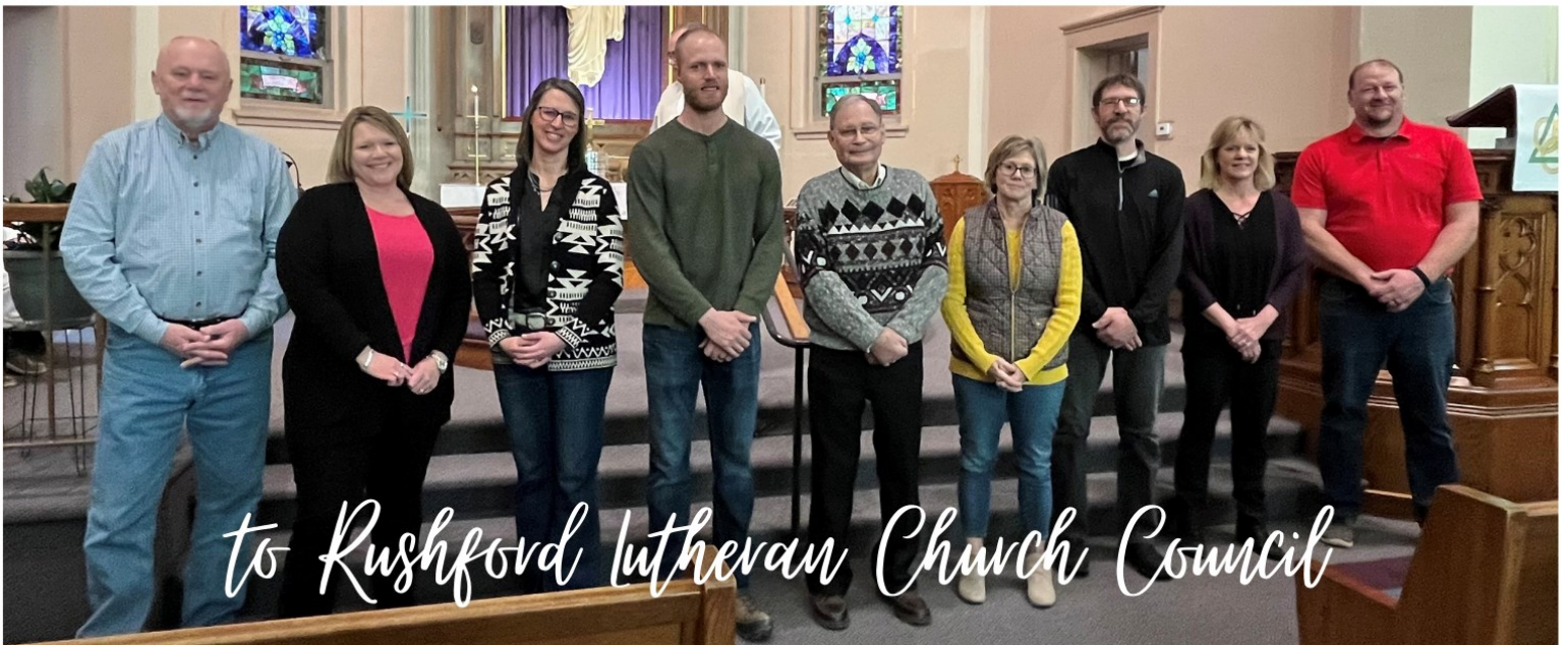
to Rushford Lutheran Church Council