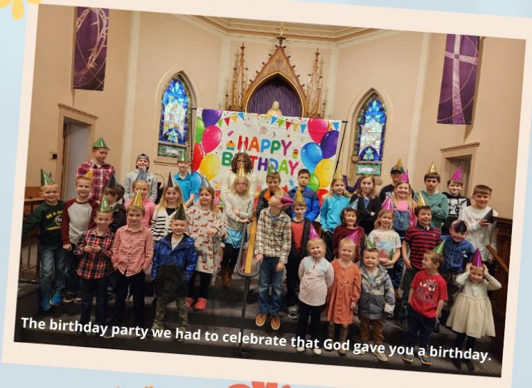
The birthday party we had to celebrate that God gave you a birthday.