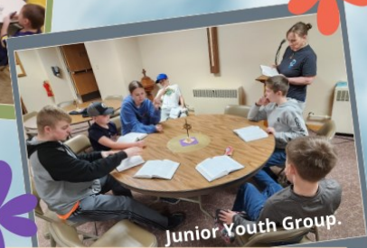
Junior Youth Group.