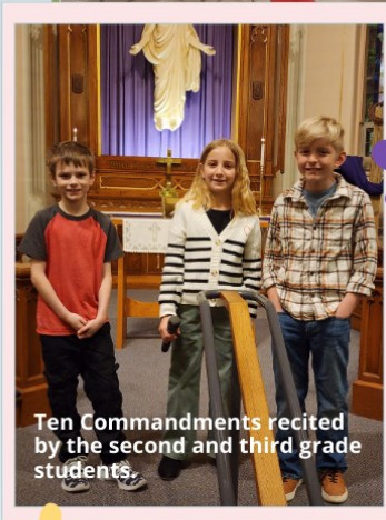
Ten Commandments recited by the second and third grade students.