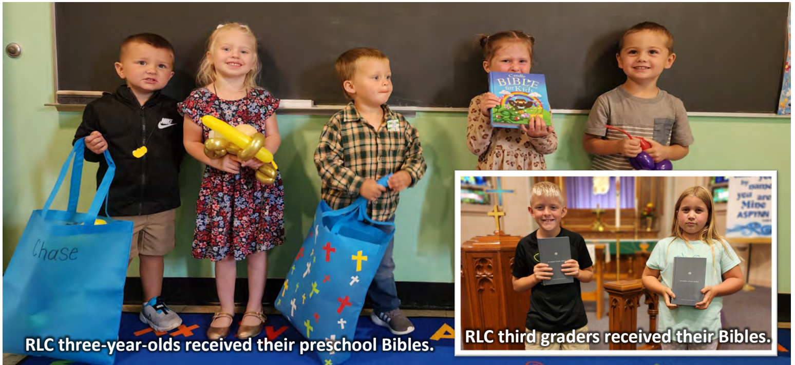
RLC three-year-olds received their preschool Bibles.