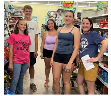
Above, students and leaders took a road trip to shop for our Hometown Heroes on August 29, that topped off with a stop at Culver's.